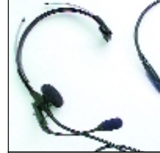
JMMN4066 Light Weight Headset with Boom Mic