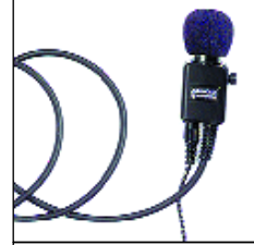
JMMN4062 Earpiece with Mic/PTT