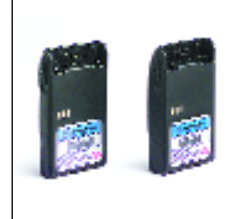
JMNN4023/4024 Slim & Hicap Li-Ion Batteries