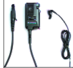
JMMN4064 Ear Mic VOX/PTT Interface Module