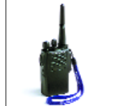
JMZN4020 Radio Wrist Strap

Not pictured: Single Rapid Charger HTN3006 Multi-Unit Rapid Charger TNTN4031A