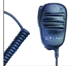
JMMN4067 Remote Speaker Mic